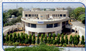
Indian Maritime University